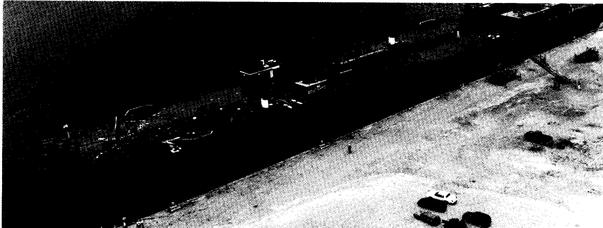
Tug CAPT FRED BOUCHARD and the T/B NO. 155

Vessel Name: B. NO. 155 Biennial Inspection: 02 APR 92 Expiration Date: 02 APR 94 Inspection Zone: MIAMI, FL Inspected for carriage of: GRADE A AND LOWER Capacity: 188,400 BLS Route: OCEANS AND COASTWISE Total Persons Allowed: 0 Last Inspection: REINSPECTION Date of Inspection: 08 JUN 93 Inspection Zone: NEW ORLEANS, LA Drydocked: 02 OCT 91 Inspection Zone: MOBILE, AL