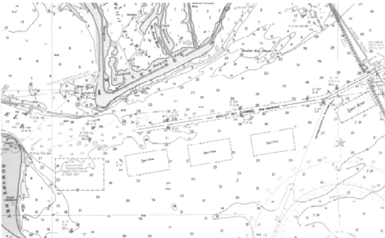
Figure 1 - Portion of chart 11414 showing the area of the collision

On 10 August 1993, following the casualty, the Aids to Navigation Team from Coast Guard Group St. Petersburg conducted position checks on Egmont Channel Lighted Buoy 17 (Light List #18560), Lighted Buoy 18 (Light List #18565), Mullet Key Channel Lighted Buoy 19 (Light List #18580), Lighted Bell Buoy 20 (Light List #18585), Lighted Buoy 21 (Light List #18600), Lighted Buoy 22 (Light List #18605), Lighted Buoy 23 (Light List #18610), Lighted Buoy 24 (Light List #18615), Mullet Key Range Front Light (Light List #18590) and Mullet Key Range Rear Light (Light List #18595). All aids were on station and watching properly.