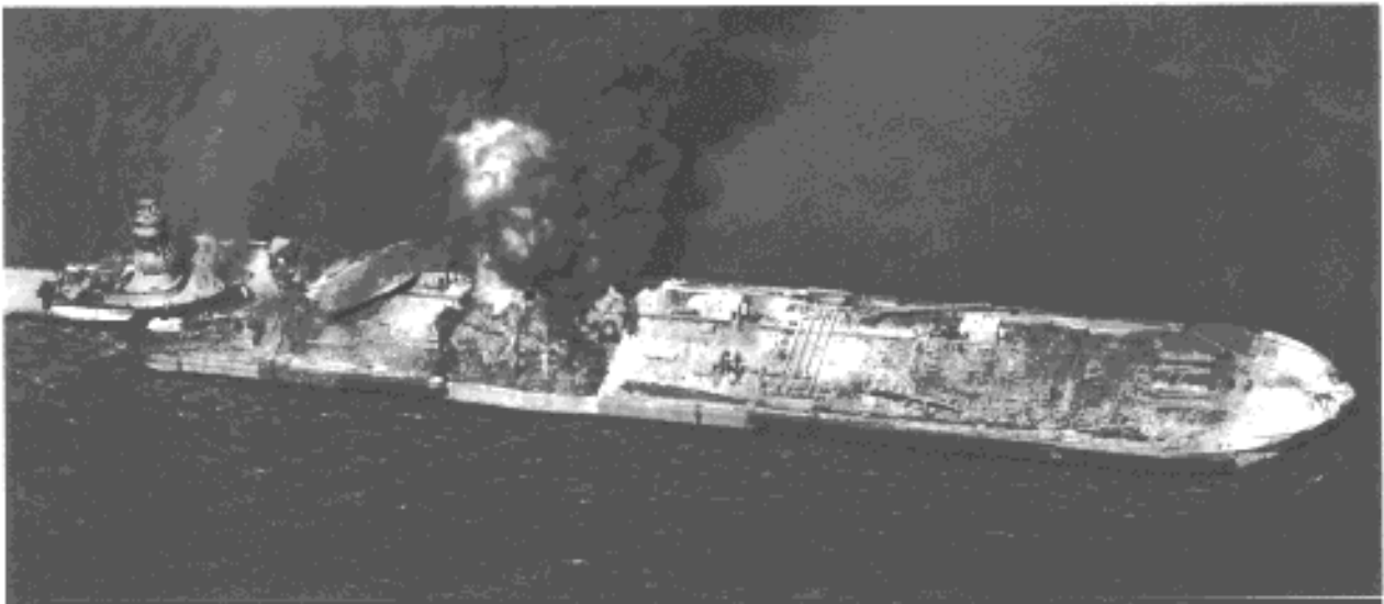
Fire aboard the T/B OCEAN 255