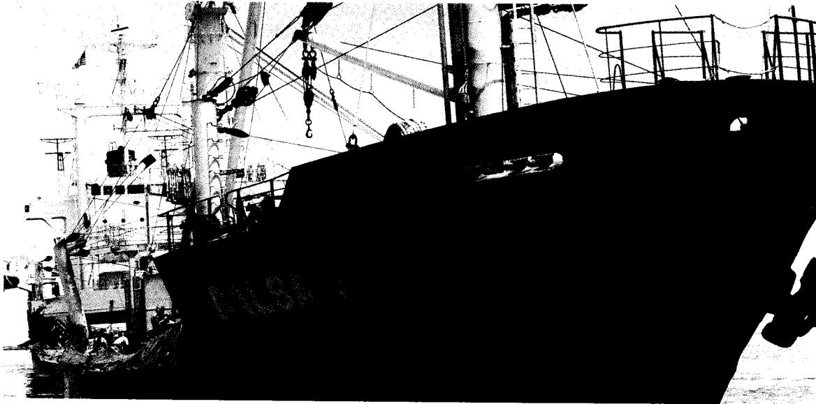
The M/V Balsa 37

d. Name: SEAFARER Flag: U.S. Official Number: D532672 Call Sign: WTQ7000 Service: TOWBOAT/TUGBOAT Gross Tons: 179 Net Tons: 122 Length: 37.0m (121.5') Breadth (molded): 10.5m (34.5') Depth (molded): 4.0m (13.0') Propulsion: DIESEL REDUCTION Horsepower: 5600 Home Port: PHILADELPHIA, PA Date Built: 1971 Built by: MAIN IRON WORKS, INC. HOUMA, LA Owner: MARITRANS OPERATING PARTNERS, L.P. 300 DELAWARE AVENUE SUITE 1130 WILMINGTON, DE 19801 Operator: MARITRANS OPERATING PARTNERS, L.P. Master: CHARLES C. CHAPMAN